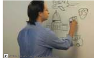
Watch this video on www.Youtube.com The Brown Bailout... Why is Congress Playing Favorites? And How Does This Impact You? youtube.com/brownbailout