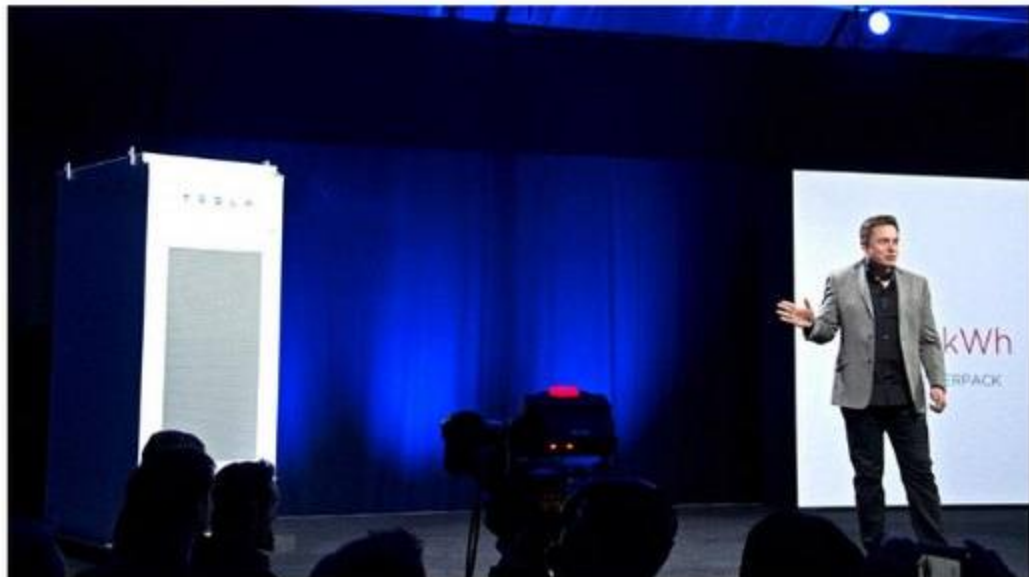
During an event at Tesla's design studio in Hawthorne, Elon Musk introduces a line of batteries for homes and businesses.