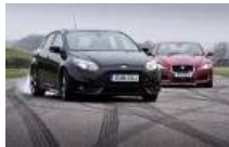
Ford Focus ST And Jaguar XFR Chase Scene Coming To Goodwood...