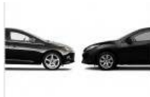
Ford Focus vs Mazda Mazda3: Compare Cars