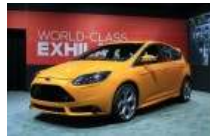
Drive To The Summer X Games In A Ford Focus ST...Simulator