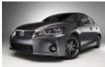
2012 Lexus CT 200h Vs 2012 Ford Focus Titanium: Compact...