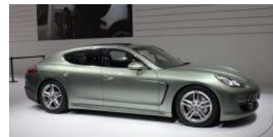
52 MPG At 70 MPH? No, Not In A Prius--In A Porsche Panamera