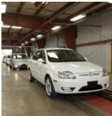
2012 Coda Sedans on assembly line, Benicia, California, March 2012