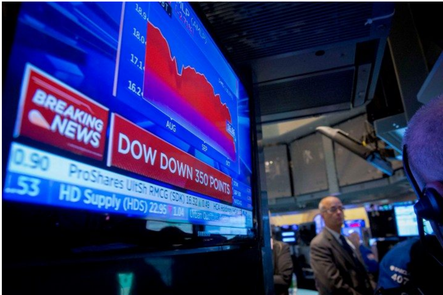
A screen displays news on the Dow Jones industrial average just after the opening bell on the floor of the New York Stock Exchange on Oct. 15.