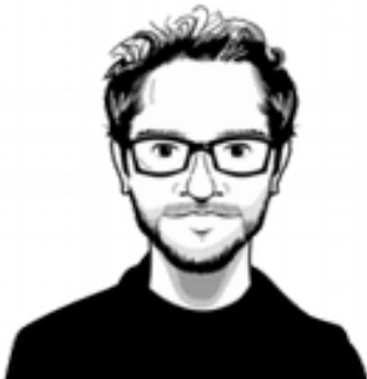
(Chahal).