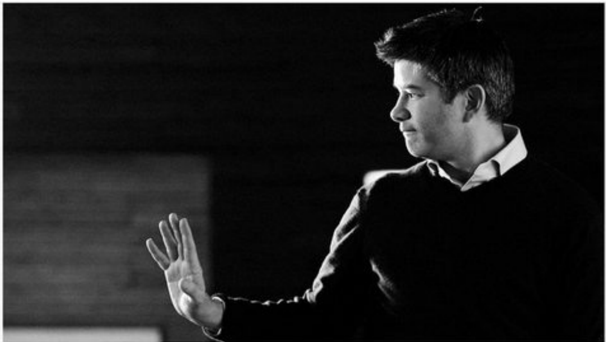
Uber C.E.O. Travis Kalanick, 2014.

It has been said that Silicon Valley, or the 50 or so square-mile area extending from San Francisco to the base of the peninsula, has overseen the creation of more wealth than any place in the history of mankind. It's made people richer than the oil industry; it has created more money than the Gold Rush. Silicon chips, lines of code, and rectangular screens have even minted more wealth than religious wars.