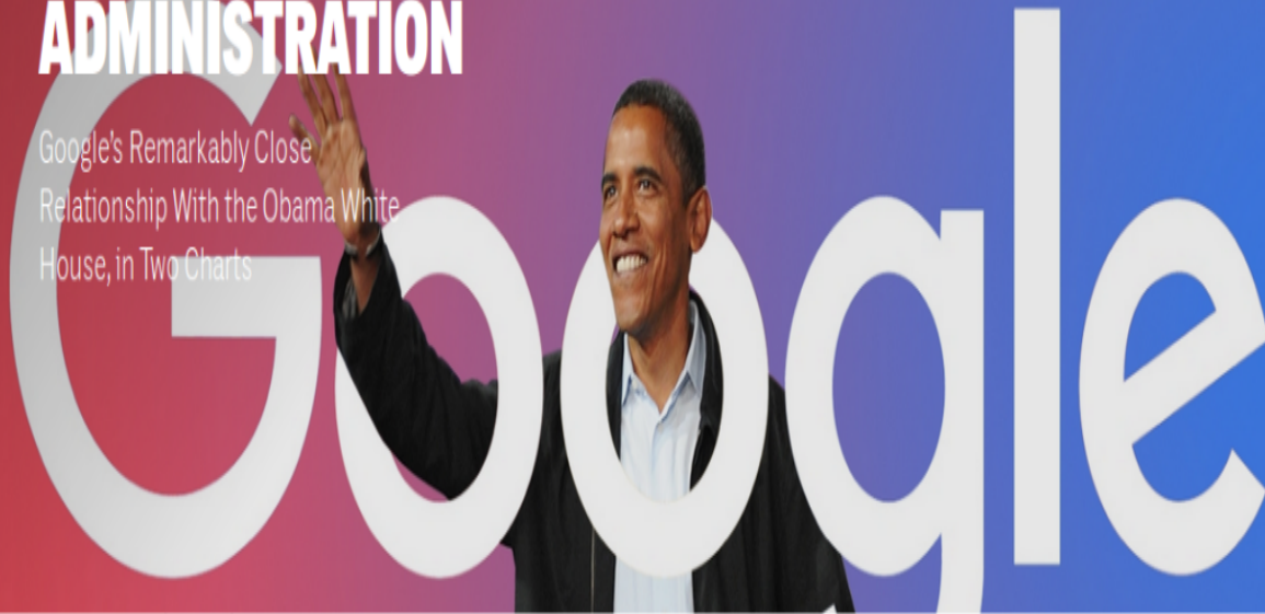
Illustration by The Intercept.

Google's Remarkably Close Relationship With the Obama White House, in Two Charts