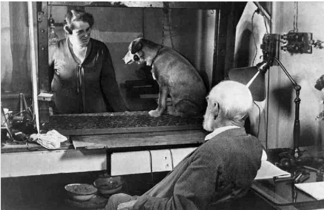
Ivan Pavlov watching an experiment with a dog in 1934.

The psychologist James Olds (1922-76), one of the founders of modern neuroscience, conducted an experiment at McGill University in 1953 in which he implanted electrodes deep in the brains of rats and started observing their responses to electrical stimulation at various sites. His key observation resulted from an accident: He missed the desired anatomical site slightly on one particular rat. After recovering from surgery, the animal was placed in a special chamber. Every time it went to a corner of the chamber, it received a small electrical stimulus to the brain, with each corner stimulating a different site. The rat kept returning to one specific corner, even skipping eating to hang out there and get the brain stimulation.