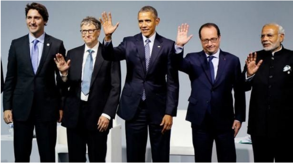
Canadian Prime Minister Justin Trudeau, Microsoft co-founder Bill Gates, Former US President Barack Obama, French President Francois Hollande and Indian Prime Minister Narendra Modi at the Paris Climate Conference in 2015.

After rising by 0.113C per decade between 1950 and 1999, temperatures appeared to have stabilized between 2000 and 2014, despite rising levels of CO2 emissions, which climate change scientists said were responsible for the earlier warming.