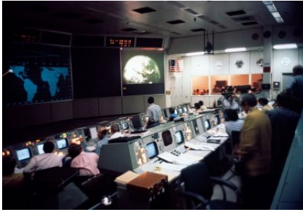
Inspiration from probably the coolest room in the world at the time, the Apollo mission control in Houston.

Ask yourself how many billionaire masters-of-the-universe it takes for a successful space race compared to the number of scientists, engineers, mathematicians, technicians, physicists, et al. From the anecdote of the NASA administrator it takes about three, but if he is to make good on his goal of returning to the Moon in 2024 and then eventually taking humanity to Mars it will take a generation packed full of those other roles. To understand that we'll have to take a trip back to the Apollo era, and how that generation of kids were inspired by the spacecraft on their screens.