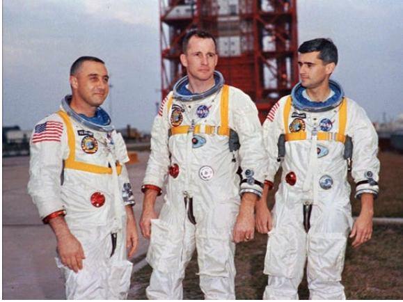
Apollo 1 astronauts, from left, Virgil "Gus" Grissom, Edward White II, and Roger Chaffee pose next to their Saturn 1 launch vehicle in this Jan. 17, 1967, photo at Launch Complex 34 at Cape Canaveral Air Station in Cape Canaveral, Fla.

Apollo 1 would have been the first manned flight, with astronauts Virgil "Gus" Grissom, Ed White and Roger Chaffee onboard. That 1967 mission was supposed to be simple — fly the vehicle, fire the Module Engine and return to Earth.