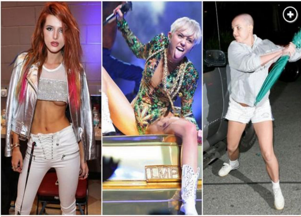
Bella Thorne, Miley Cyrus in 2014 and Britney Spears in 2007.

B ella Thorne, Miley Cyrus in 2014 and Britney Spears in 2007.