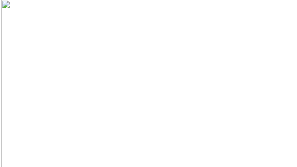
A very special moment during Democratic National Convention 2016