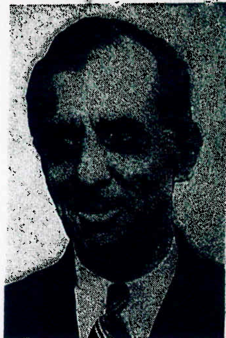
GEN. SMEDLEY D. BUTLER Who turned down this particular offer of a ride on a white horse

On July 27, 1934, he deposited $39,106.78. On July 27, 1934 (the same day) he again deposited $97,766.94.