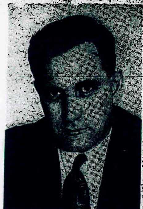
JOHN W. McCORMACK