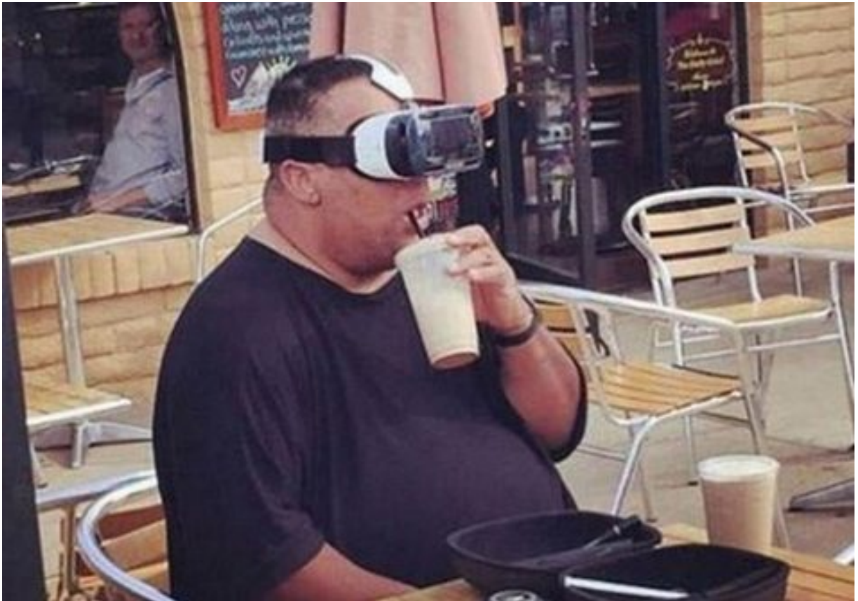
(Typical VR User)