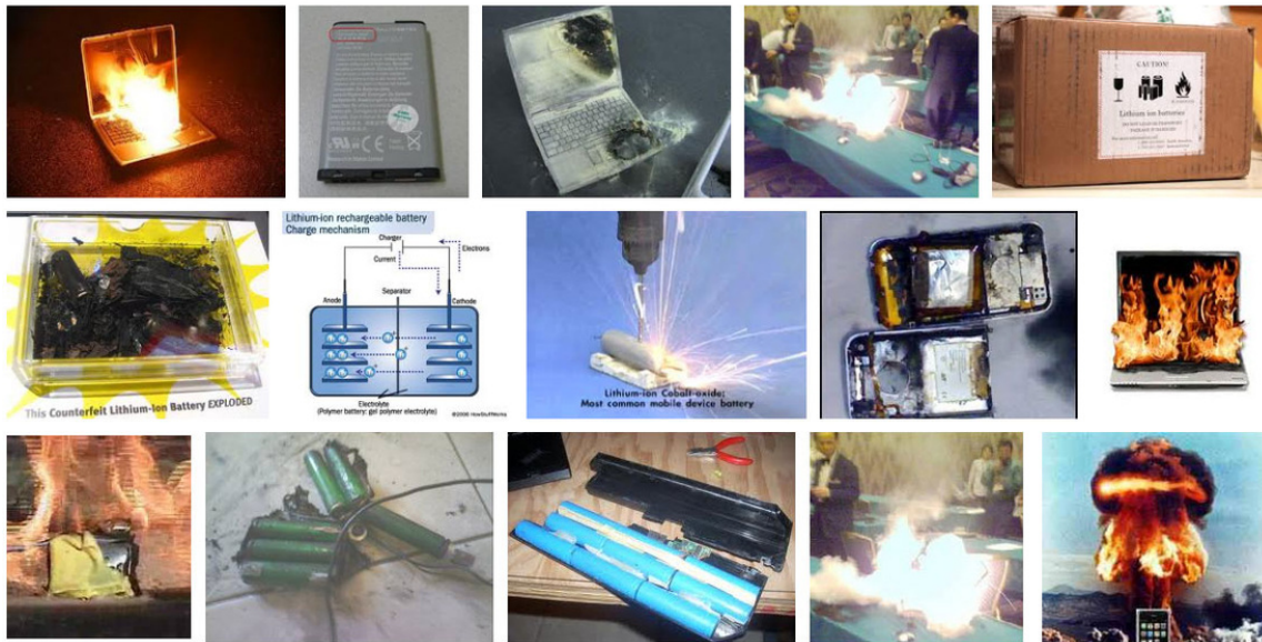
LITHIUM ION BATERIES BLOWING UP ON THEIR OWN