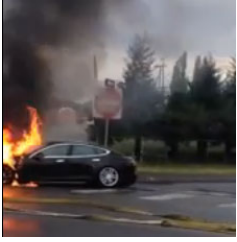
TESLA BATTERIES EXPLODE INTO FLAMES ON PUBLIC ROAD

Look at this: We were just sent a link that our website showed up in this movie: Here is another link to the movie at: http://tinypic.com/r/7295hs/6