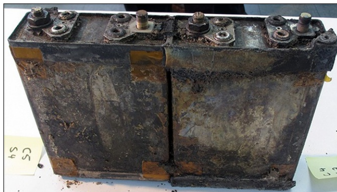
THIS IS AN ACTUAL BOEING BATTERY