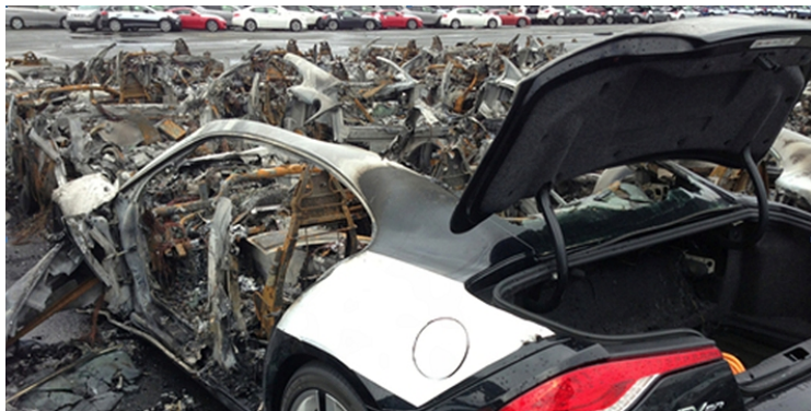
FISKERS CARS THAT BLEW UP AND BURST INTO FLAMES JUST BECAUSE THEIR LITHIUM ION BATTERIES GOT WET

"Here is where they make some of these batteries, in forced labor camps: http://www.thedailybeast.com/newsweek/2013/01/13/china-s-labor-pains.html Because, as we all know, chinese prostitutes are the best choice to make the things that keep our airplanes in the air and our cars on the road. The silicon valley venture capital guys front these batteries because they have such cheap labor to give them great profits.. quality control? not so much..."