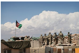
Pul-e Alam, Afghanistan: U.S. Army soldier survey the landscape from inside an Afghan National Army outpost during a patrol.

After routing the Taliban in Afghanistan in 2001, the U.S. government began a now 13-year effort to stabilize and develop the country. It has cost taxpayers billions — and some say, achieved little. These stories examine the waste and problems plaguing U.S. reconstruction efforts that, despite the end of combat, will continue to cost billions — even as our military presence shrinks.