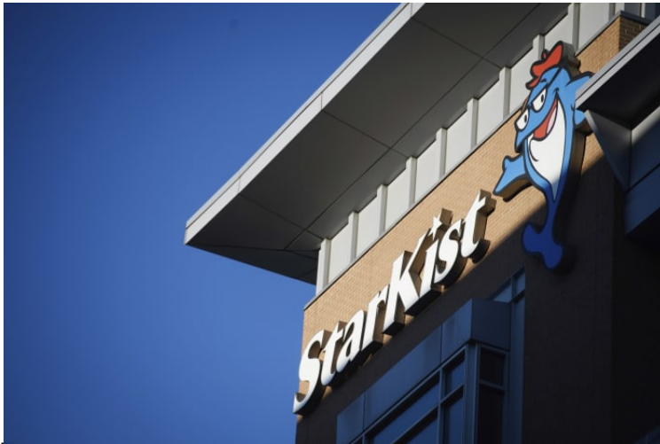
StarKist Tuna is seeking to derail a lawsuit alleging a price-fixing conspiracy costing buyers more than $1 billion.