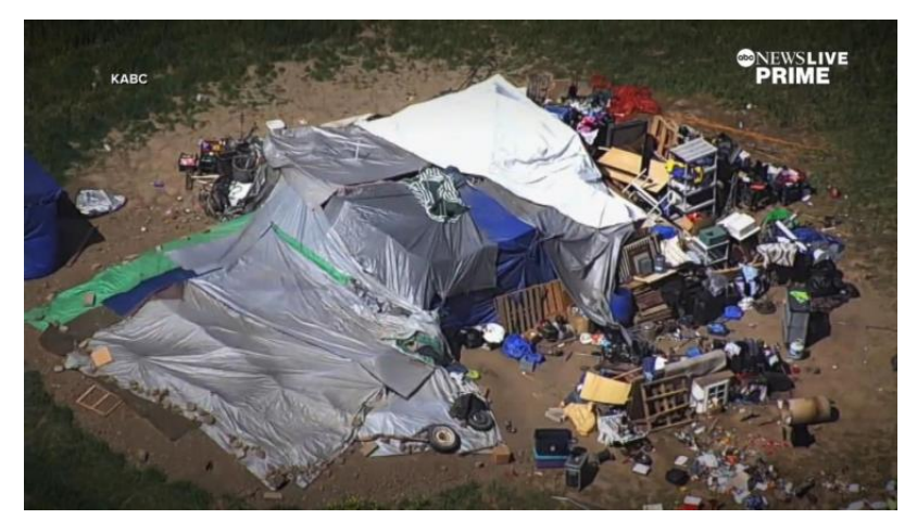
Scroll back up to restore default view.

California failed to track the effectiveness of its billion-dollar spending on homelessness programs and "must do more to assess the cost-effectiveness of its homelessness programs," according to a new state <u>audit</u> report.