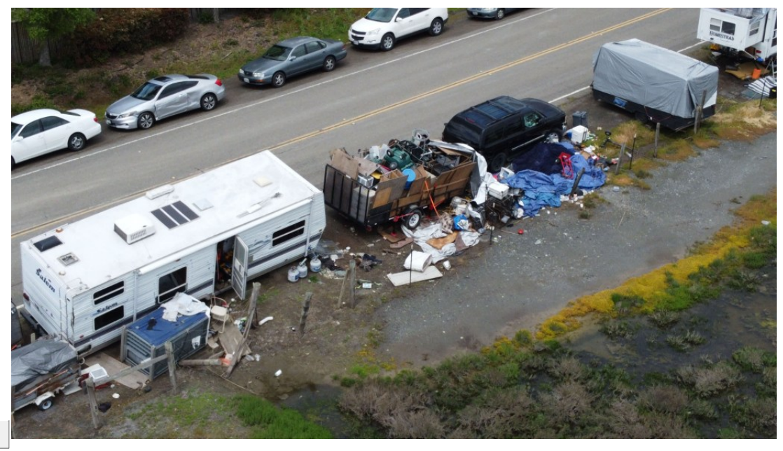
RVs, trailers and cars line Binford Road.