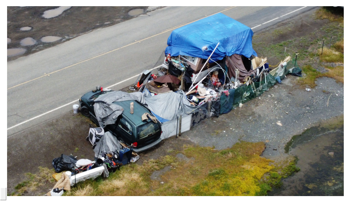
A person is seen sitting outside of their trailer amongst a pile of their belongings.

Every Marin millionaire from the Silicon Valley cesspool of corruption: