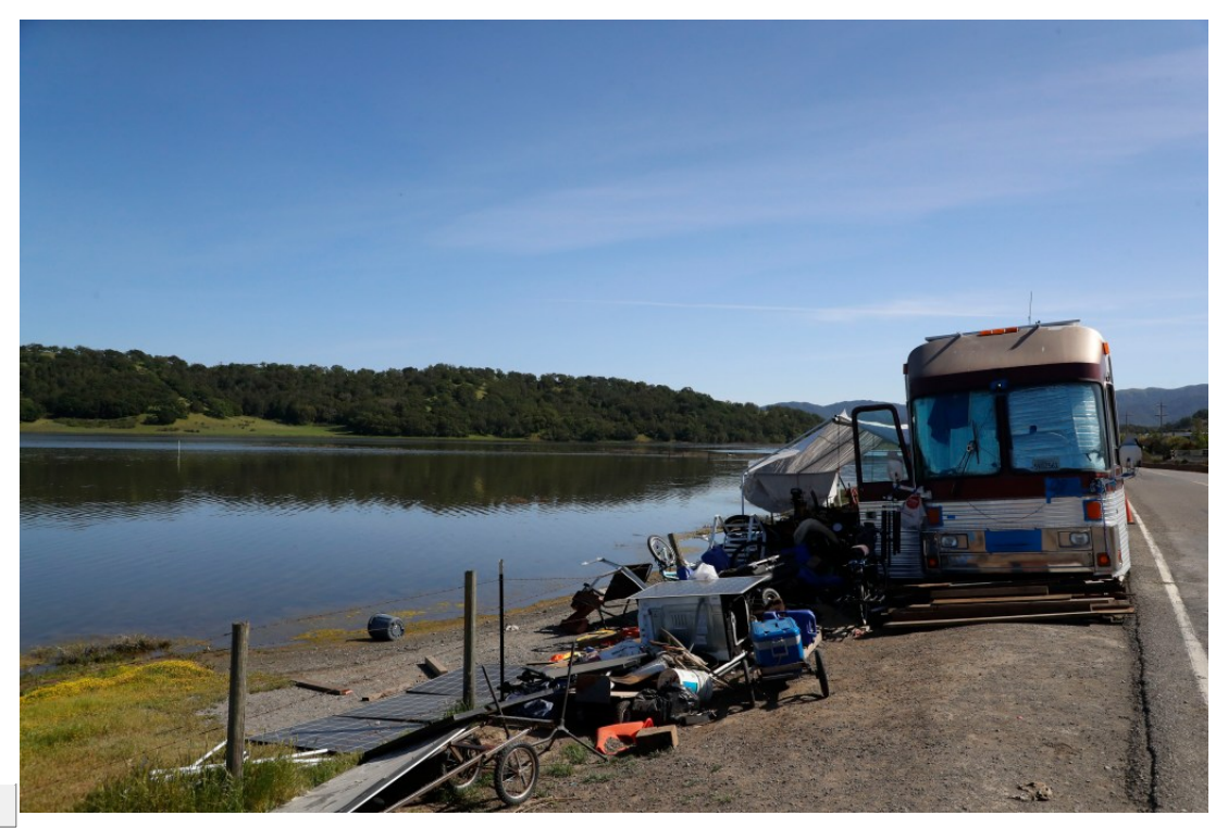
Binford Road in the city of Novato has devolved into a makeshift neighborhood of "tweakers" with hordes of people living apparently rent-free in a shabby collection of brokendown RVs and trailers parked at the side of the street.

While at Binford Road, The Post spoke to a man who said he was a van dweller but chose not to live at the camp.