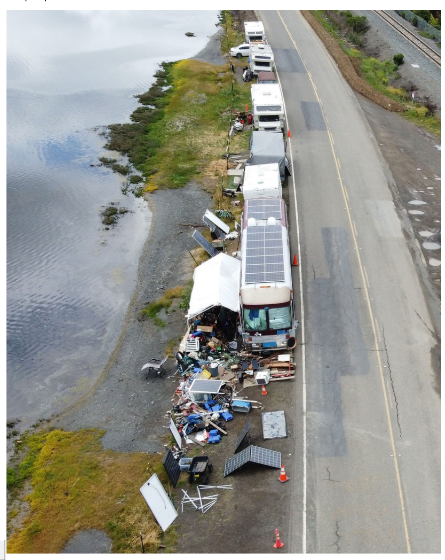
Hordes of people living apparently rent-free in a shabby collection of broken-down RVs and trailers parked at the side of the street.

"But I think that's another issue that the public oftentimes forgets, or chooses to overlook, is the only way that you're going to help these people is if you get them to a spot where they're willing to accept help."