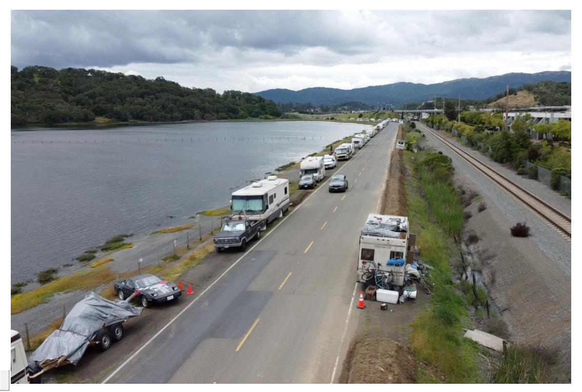
\overrightarrow{\text{RV}} s and other vehicles form a large encampment along Binford Road.

Those who call it home spoke highly of their makeshift neighborhood and the authorities who allow them to remain.