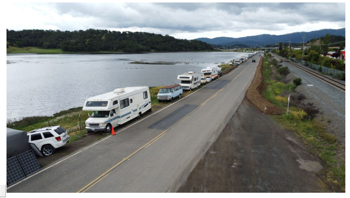
A two-mile strip of road in posh Marin County, California has been overrun by a vagrant camp which has brought drugs and devastation to the area.

The camp has also proven to harbor crime. Authorities investigating a convicted sex offender who lived along Binford Road in March instead discovered the dead body of a man who had overdosed on fentanyl, according to a report from MarinLocalNews.com.