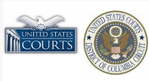
THE U.S. FEDERAL COURTS