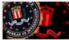
MULTIPLE FEDERAL LAW ENFORCEMENT ENTITIES