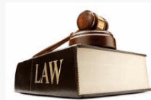
MULTIPLE LAW FIRMS AND INVESTIGATORS