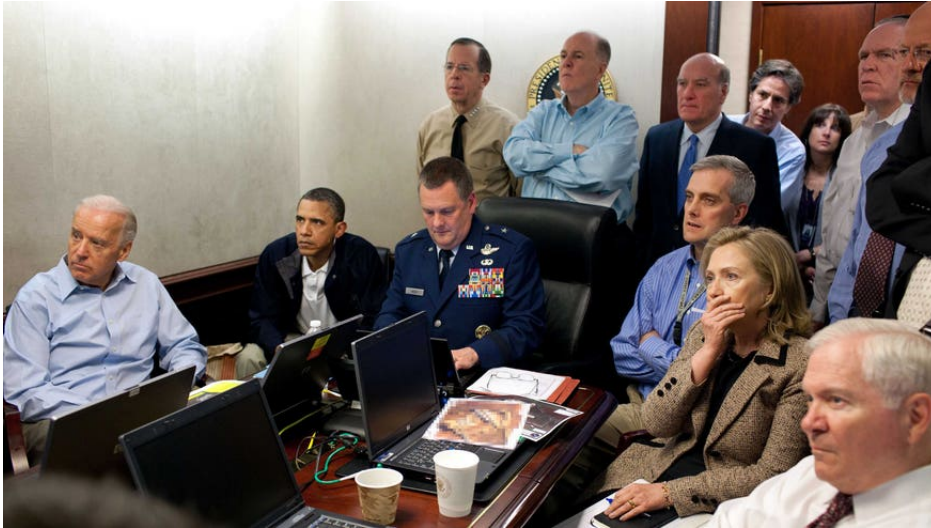
May 1: Secretary of State Hillary Rodham Clinton, President Barack Obama and Vice President Joe Biden, along with with members of the national security team, receive an update on the mission against Usama bin Laden in the Situation Room of the White House.

The Gawker website is under fire for trying to expose the CIA agent who may have helped lead the effort to kill Usama Bin Laden — despite efforts by the U.S. government and media to keep his identity secret for security reasons.