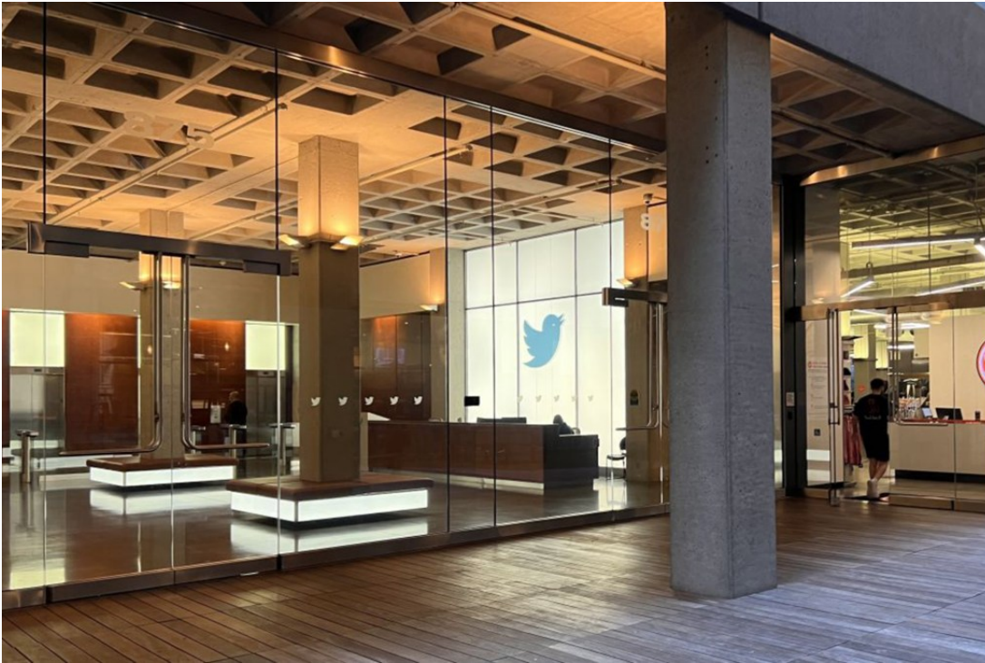
Twitter is being sued for having a part in the slaughter of innocent lives because its policies made extremist materials available.

All expected the "information superhighway" to bring government closer to the people, fulfilling the dream of what Ross Perot called an "electronic town hall."