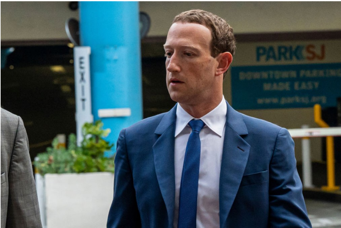
Mark Zuckerberg is often called out for Facebook censoring freedom of speech.

Progressives, for their part, are just as confident they know whether Republican legislators can be trusted to distinguish between pornography and art.